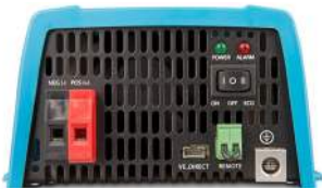
Phoenix 12/375 VE.Direct