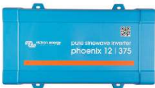
Phoenix 12/375 VE.Direct