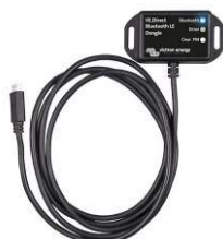
VE.Direct Bluetooth Smart dongle (must be ordered separately)

An excessively high or low battery voltage is indicated by an audible and visual alarm, and a relay for remote signalling.