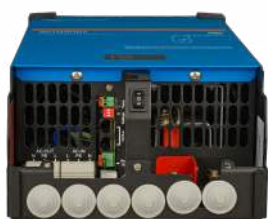
MultiPlus 2000 VA (bottom cover removed)