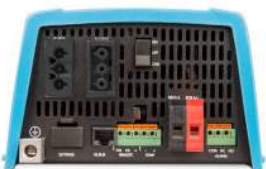
MultiPlus 500 / 800 / 1200 / 1600 VA